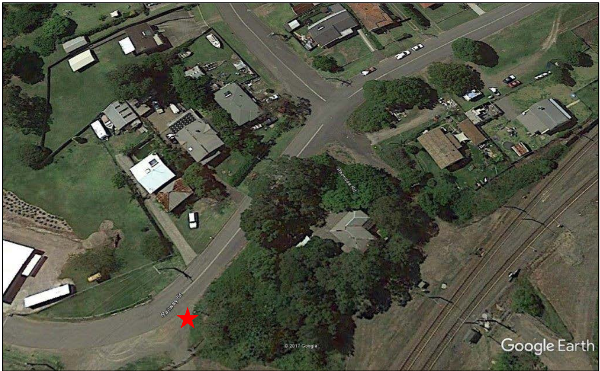
Location EPL – B Modified noise monitoring location