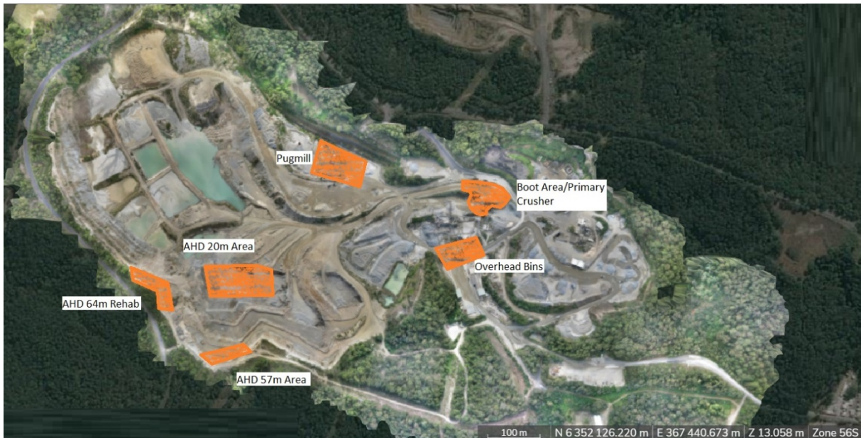
Location of quarrying activities during the survey.