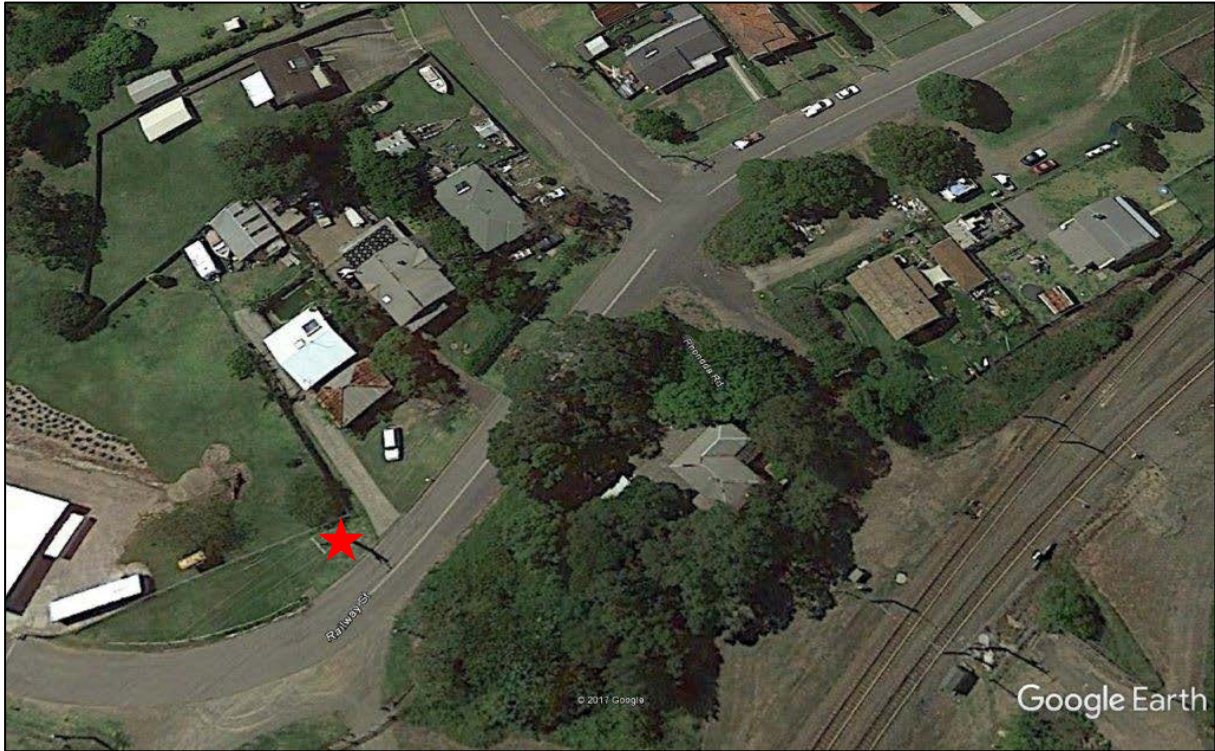
Location EPL – B Modified noise monitoring location