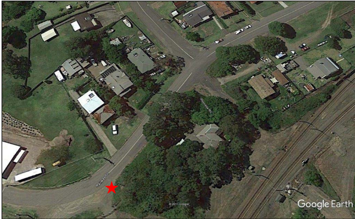
Location EPL – B Modified noise monitoring location