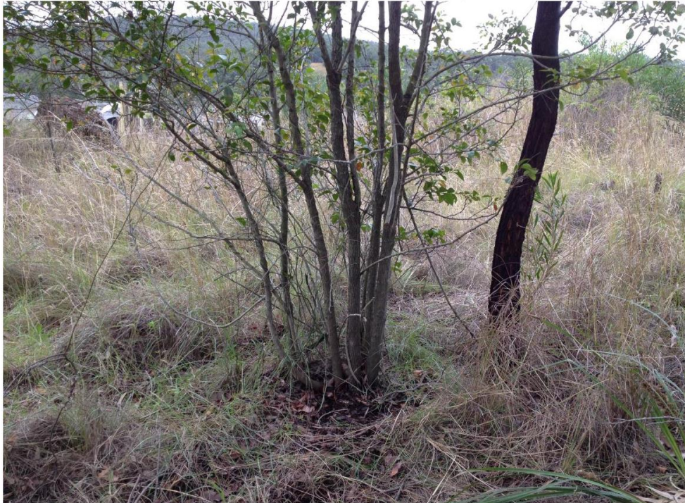
Appendix 8. Photo of condition of site Prior to the completion of works.