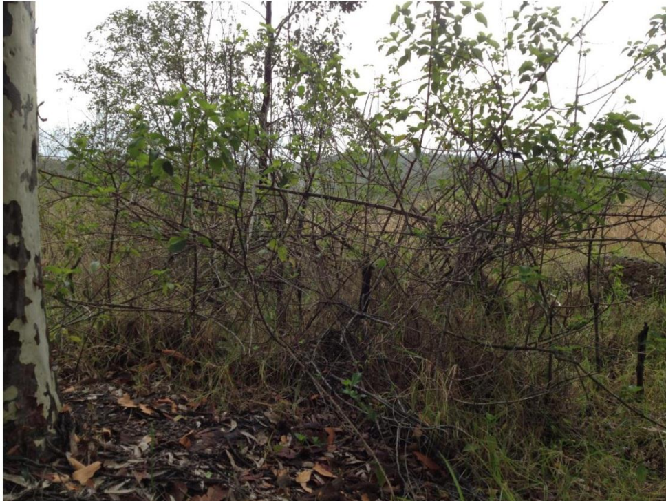
Appendix 7. Photo of condition of site after the completion of works.