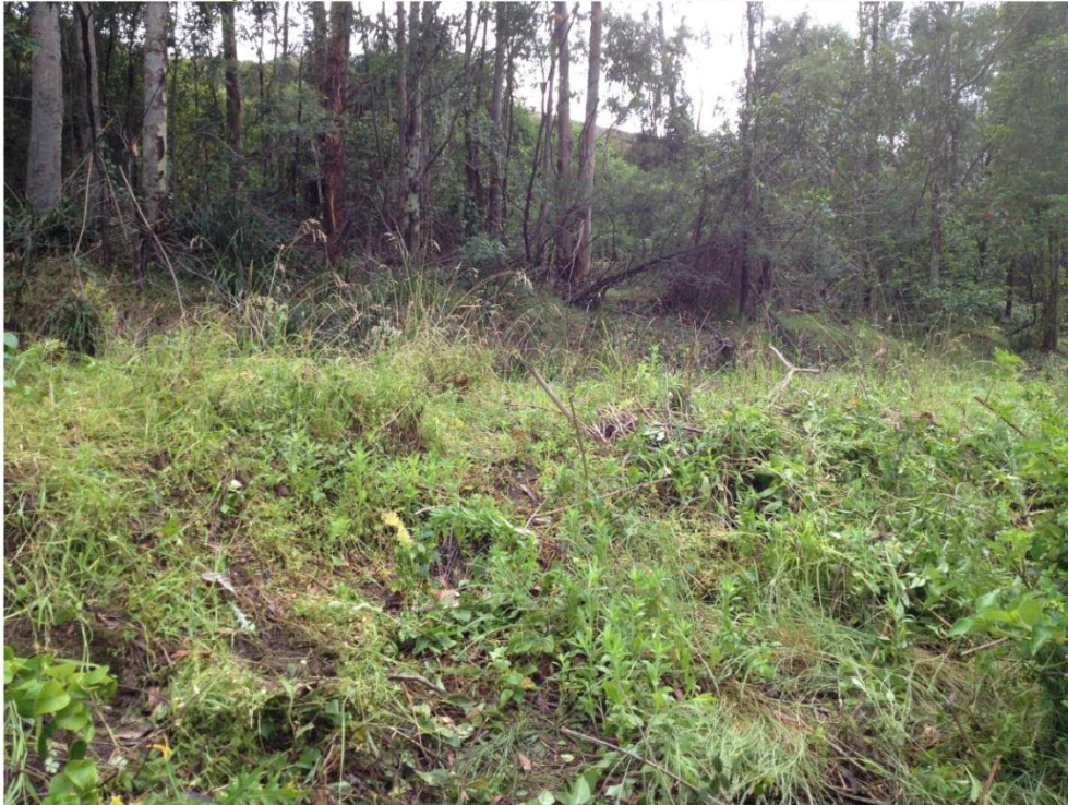
Appendix 4. Photo of condition of site prior to completion of works.