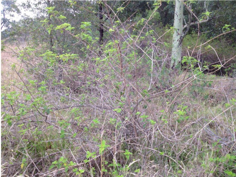
Appendix 5. Photo of condition of site after the completion of works.