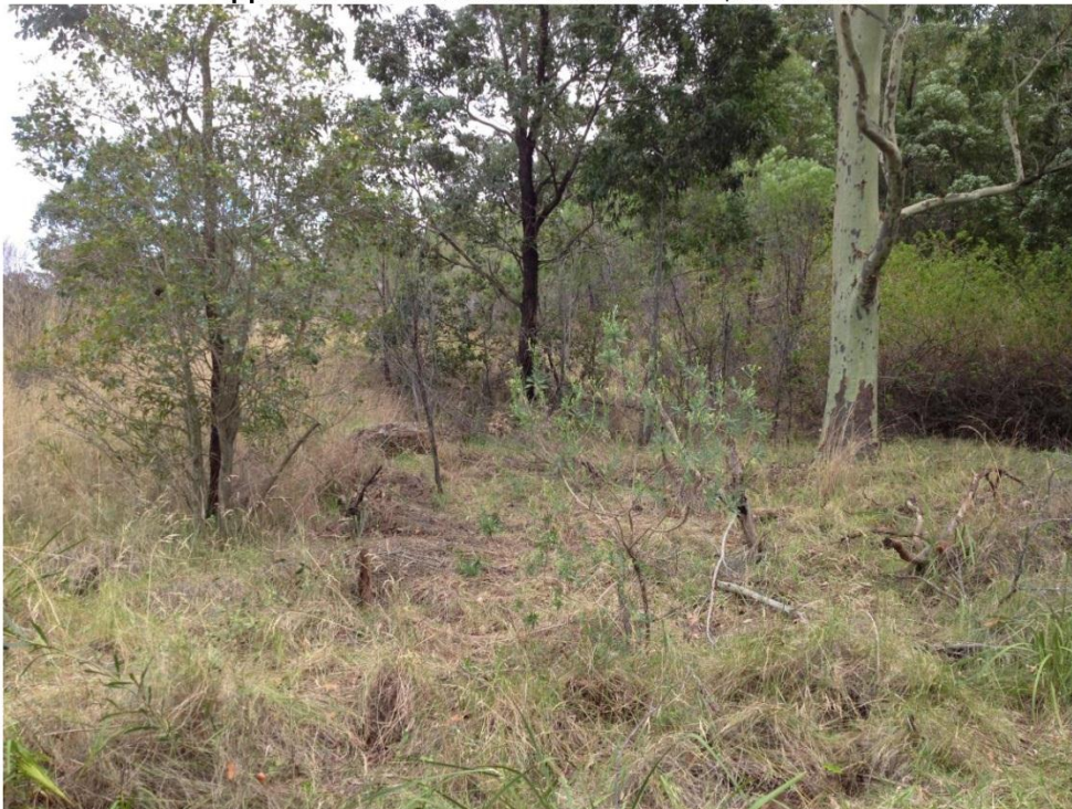
Appendix 6. Photo of condition of site prior to completion of works.