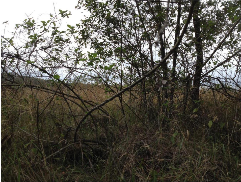
Appendix 7. Photo of condition of site after the completion of works.