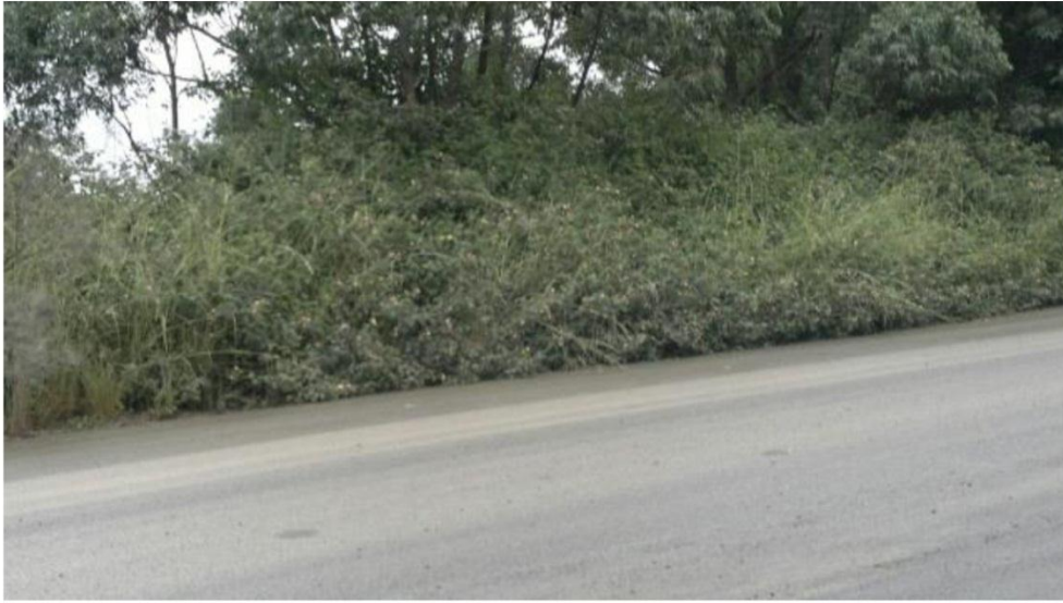
Appendix 9. Photo of condition of site during the completion of works.