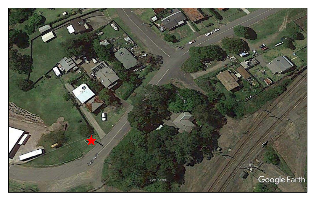
Location EPL – B Modified noise monitoring location